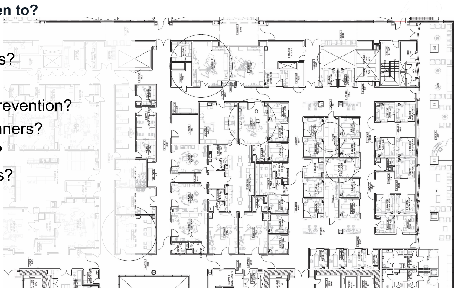
Cleveland Clinic Abu Dhabi - (Neuro, Cardio, Eye Theatres with robotics.)