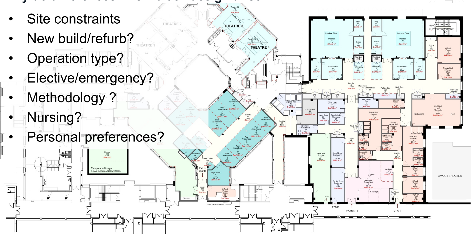
CAVOC Theatre expansion – (Principally Orthopaedic Theatres with robotics.)