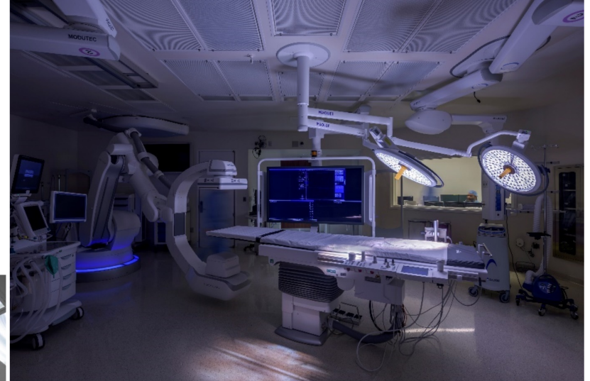
Cleveland Clinic Abu Dhabi - (Cardiac Hybrid OR)