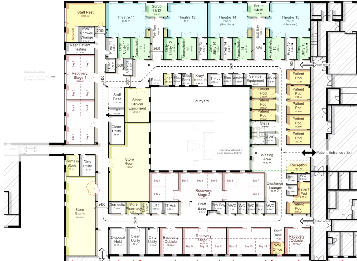
PRH Elective Care Centre – (2no. standard & 2no. ultra clean (to be used for orthopaedics))