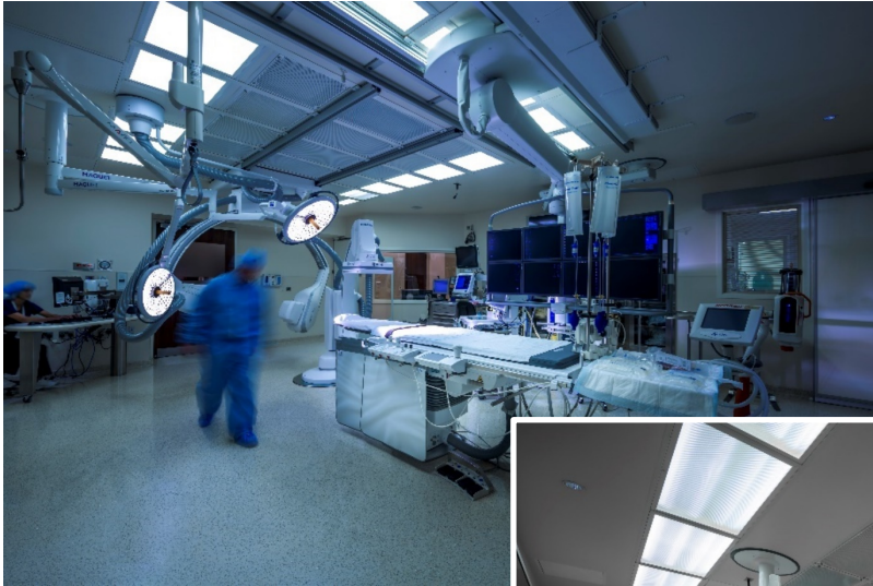
Cleveland Clinic Abu Dhabi - (Neuro OR)