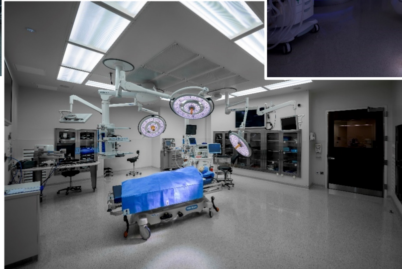
Cleveland Clinic Abu Dhabi - (Eye OR)